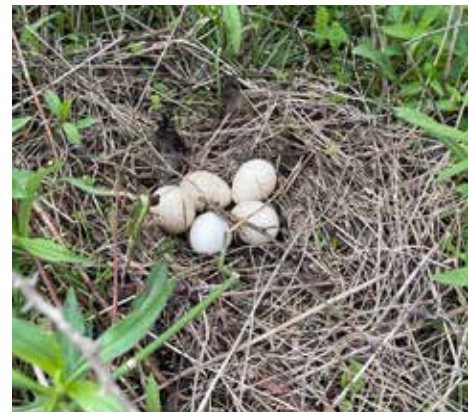
The work crew at Elkhorn Biodiversity Preserve were surprised to find a plethora of turkey feathers on the prairie. Upon further searching we found this nest of turkey eggs and unfortunately one destroyed. But we continued on to our destination to eradicate the Wild Parsnip, Poison hemlock, Garlic mustard, or any other nasties we came upon.