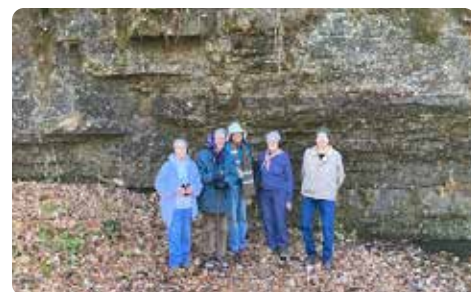
November 12th Trip to Severson Dells