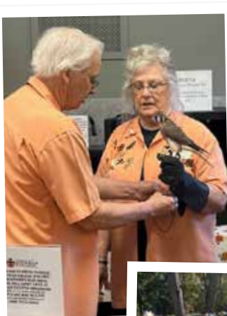
▲ Northern Illinois Raptor Rehab & Education