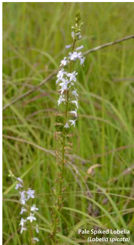
Pale Spiked Lobelia ( Lobelia spicata )