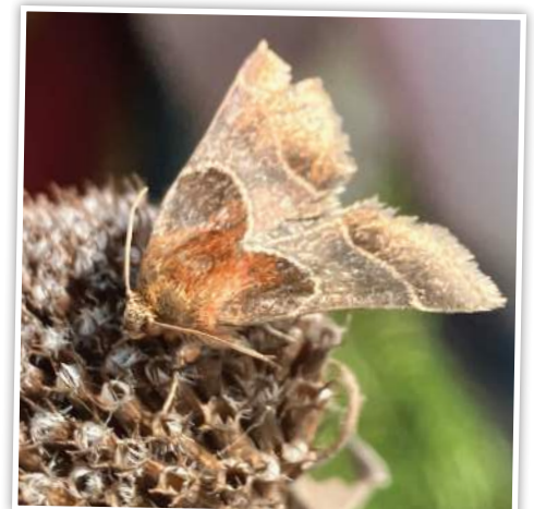
▲ ECBP – Possibly a Arcigera flower moth.