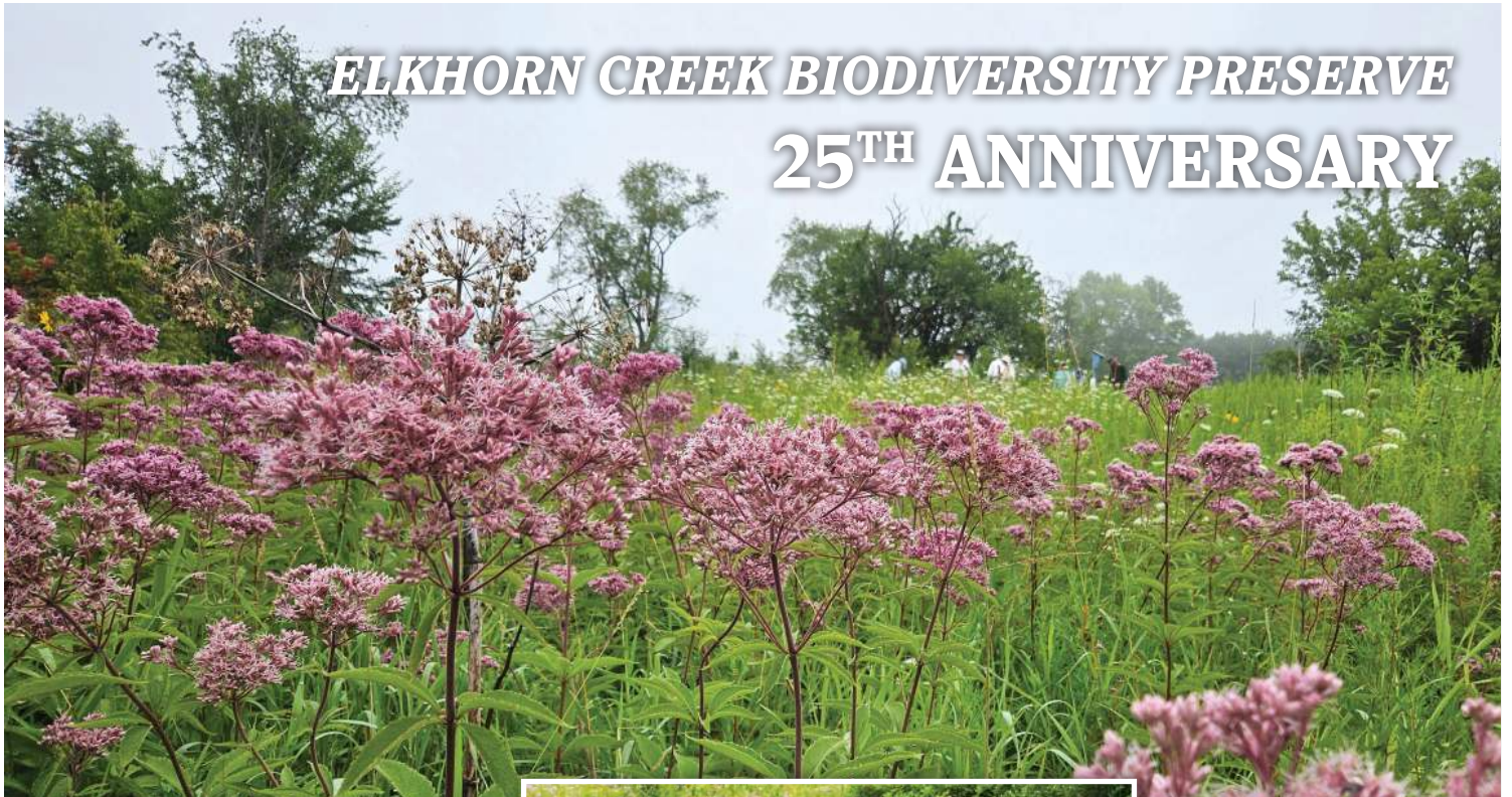
▲ (header) Eupatorium maculatum (Spotted Joe-pye Weed) ▼ Liatris aspera (Rough Blazingstar) on August 13th