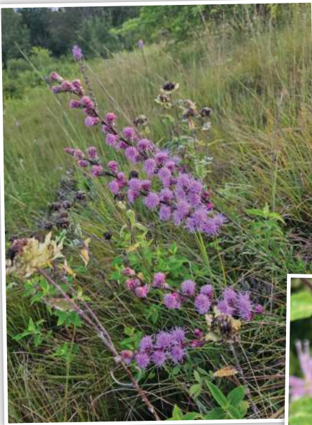
Bombus pensylvanicus (American bumblebee) on Monarda fistulosa (Wild Bergamot)