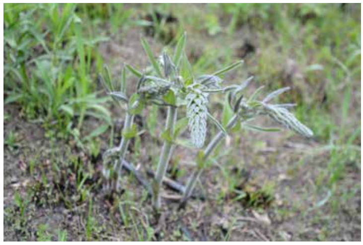
"The beautiful not yet."