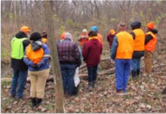
A group of attendees gather during a "Geology of the Preserves" field trip.