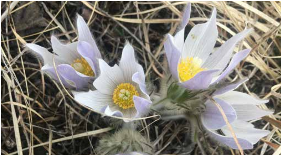
Anemone patens (Pasque Flower)