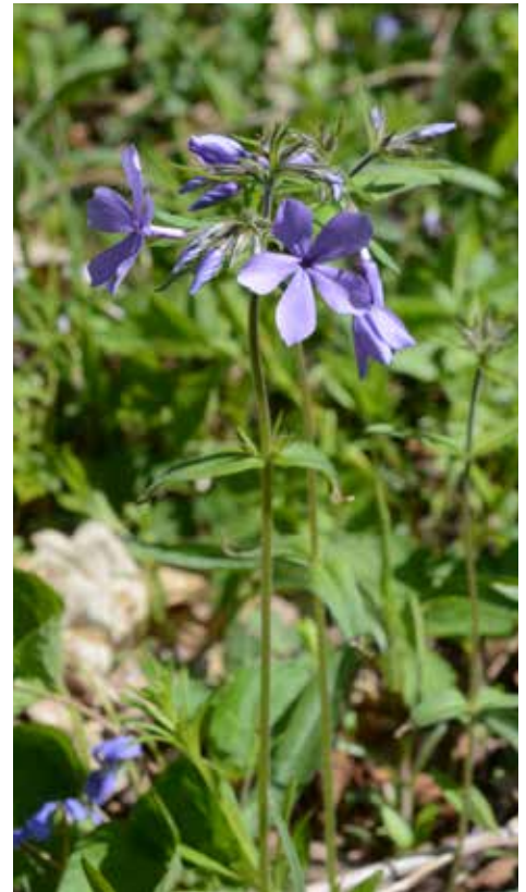
Phlox divaricata (Wild Blue Phlox)

P.S. I look forward to serving with this wonderful group of individuals. I know we had some exciting events planned over the next few months. I am sure we all understand the need for safety in our gatherings as we ride out this storm, but we will look forward to that time, hopefully in the not too distant future, when we can gather again as a group for a variety of activities, projects and learning experiences. In the meantime stay tuned to the website for any news on upcoming events, but more importantly take this time now to get outside and enjoy the spring migration which is just beginning to ramp up. Take care and stay safe. Gary G.