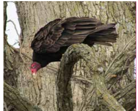
Turkey Vulture | by Anne Straight