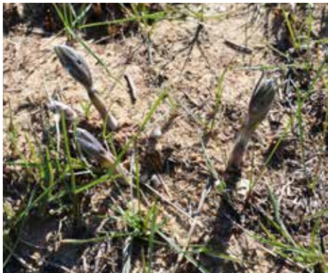
Emerging Baptisia bracteata (Cream Wild Indigo), Elkhorn Creek Biodiversity Preserve