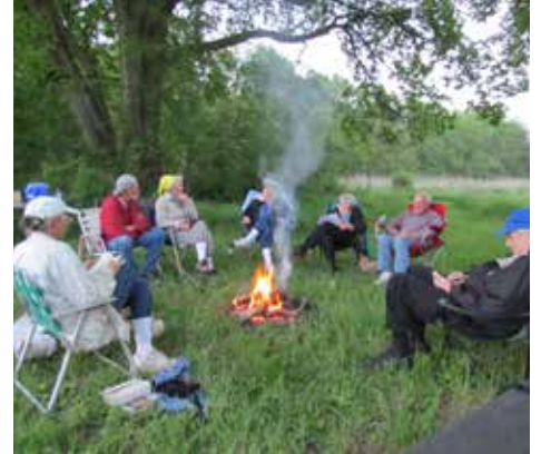
NIAS Sponored campfire held at Silver Creek Biodiversity Preserve

If our Stay-at-Home directive is lifted we plan to have our usual summer campfires, but not in our usual manner. Check our website for the latest information. We will assume that social distancing will continue and that groups will be limited to 10 people, so we will expand our campfire circle accordingly.