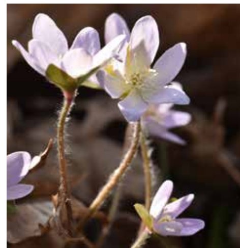
Anemone acutiloba (Sharp-lobed Hepatica)