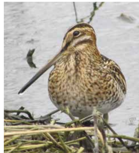
Wilson's Snipe