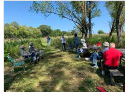
August 14th Lake Carroll Prairie Club tour attendees enjoy their lunch under a cottonwood tree.