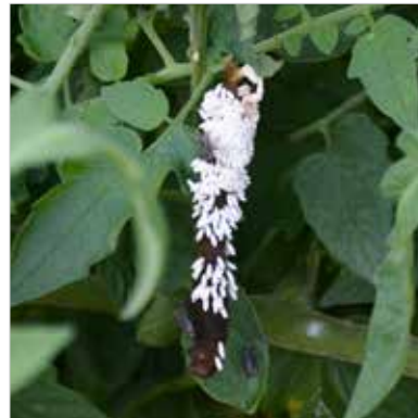
Dozens of white cocooned wasp larvae were attached to the hornworm.

One day when I spotted significant damage on a tomato plant I began my search for the larva. This time it was easy to find. The caterpillar had been parasitized by a braconid wasp ( Cotesia congregata ). Dozens of white cocooned wasp larvae were attached to the hornworm. My search and destroy mission now had turned into one of curiosity.