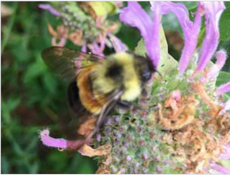
Bombus affinis or Rusty Patched Bumblebee