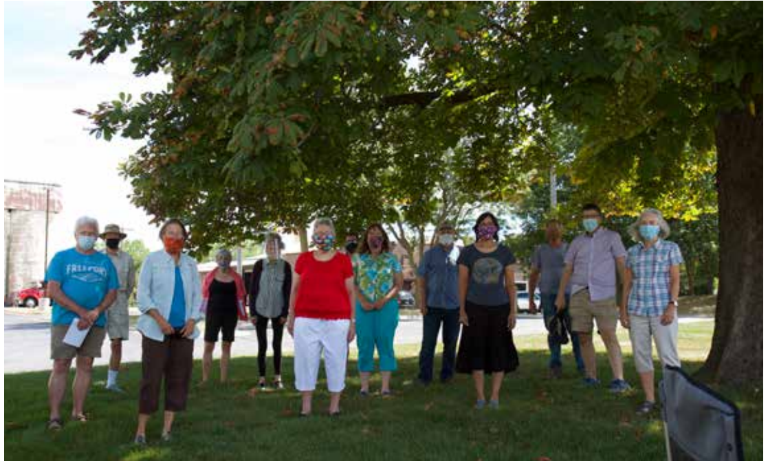
2020 Board Retreat, held August 28th in Debate Square, Freeport

Our November program will be one week later than normal (the 2nd Tuesday of the month) as November 3rd is election day (Anybody ready for this election to be over??).