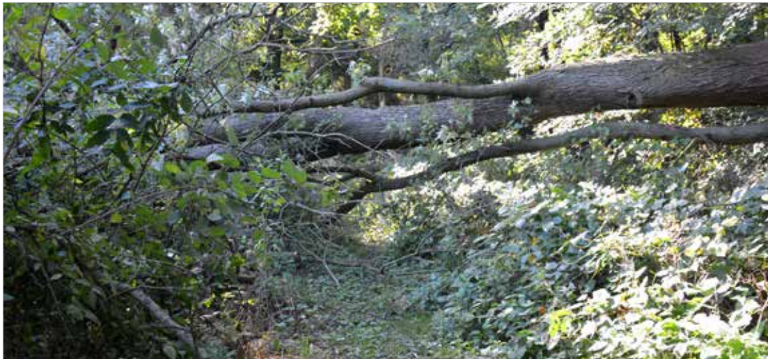
Silver Maple across a trail