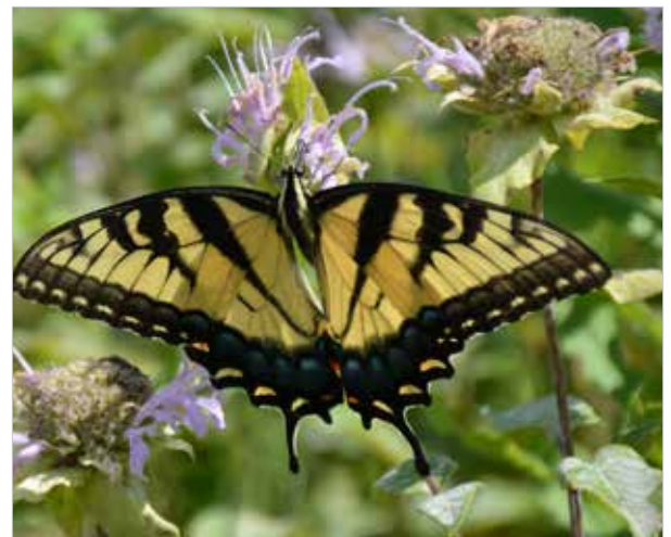
Tiger Swallowtail on Wild Bergamot ( Monarda fistulosa )

Our counters were initially puzzled by the abundance of Cabbage Butterflies, considering the non-garden habitat. However, according to the authors of Butterflies of Illinois, in addition to cultivated crucifers, caterpillar host plants can be wild crucifers, including Garlic Mustard. Since that plant experienced a banner year locally and at the preserve, we assumed that accounted for -at least in part - the explosion of Cabbage Butterflies.